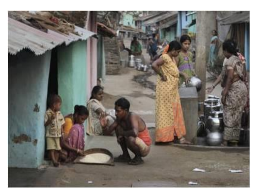
Food is a primitive desire. Nurturing and nourishing

The two basic necessities for survival of all creatures are food and shelter. How do we define basic necessities? Do we eat to live or live to eat? On the one hand, about 80% of the world's population in economically marginalized countries have very humble living conditions with room for improvement (Fig. 2). On the other hand, affluent society seems to have gone to the other extreme.