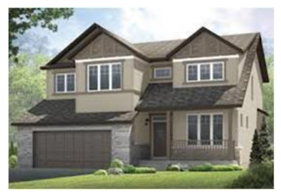
Fig 4. Luxurious home in upscale neighbourhood