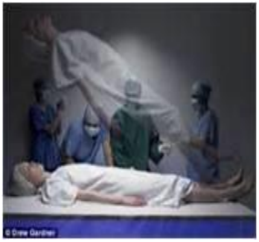
Fig. 6. Out-of-body experience

AWE proposes that the criterion for direct evidence of genuine NDE is the ability of the patient to acquire specific and detail knowledge (as oppose to general knowledge) that the patient has no conceivable means of knowing. Under this stringent criterion, several of these direct and convincing NDE cases are cited below: